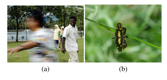
Figure 1. (a) motion blurred image (b) out of focused image

Blur exists in many digital images and is one of the typical factors that damages the quality of an image. It occurs due to many reasons including object motion, camera lens out of focus, and camera shake.